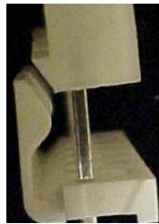
Figure 4: Mate and Lock Connector

The cable is held in place by locking edges on the connector and the mating connector housing. This mechanism is used to securely hold the cable to the motherboard – see Figure 4 below.