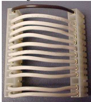
Figure 1: Power Cable IMACS-600 and IMACS-800

This Tech Tip is written to describe the process used to clean the power cable on the IMACS shelf. Please refer to Zhone Tech Tip #33 for the proper procedure if maintenance to clean the power cable is required on an IMACS-900 shelf. The IMACS-600 and IMACS-800 shelves use a 12-pin wiring harness to connect the power PCB to the shelf PCB. The cable is shown in Figure 1.